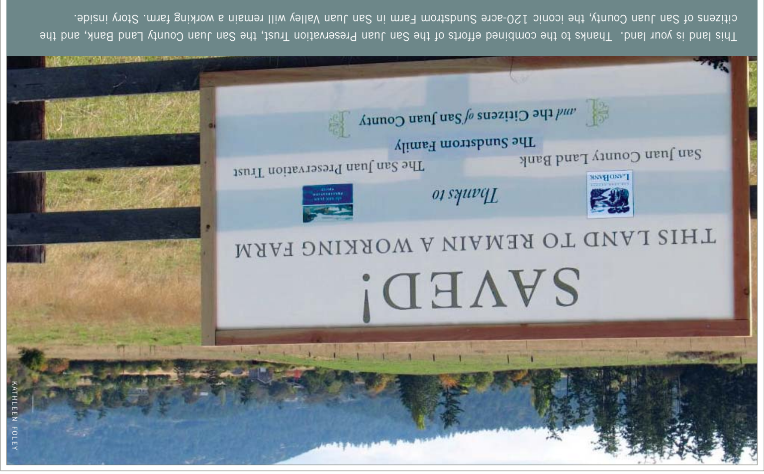
This land is your land. Thanks to the combined efforts of the San Juan Preservation Trust, the San Juan County Land Bank, and the citizens of San Juan County, the iconic 120-acre Sundstrom Farm in San Juan Valley will remain a working farm. Story inside.