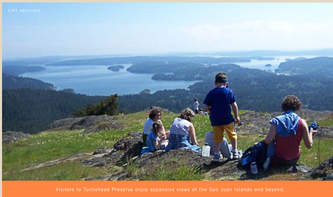
Visitors to Turtleback Mountain Preserve enjoy expansive views of the San Juan Islands and beyond.

The San Juan Preservation Trust quickly identified $600,000 towards the purchase price, including $500,000 from its own investment funds and $100,000 from four lead donors. After a brief